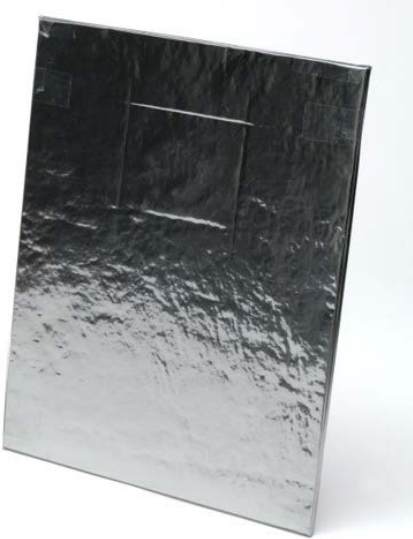
Table 1. Standard U-Vacua™ Standard Sizes + R-value

Technology: The majority of a VIP’s insulating value is from the inner vacuum. In a vacuum, heat cannot travel through the air by conduction or convection. This limited ability for heat to travel in a vacuum is what gives vacuum insulation panels such a high thermal performance and R-value. As a result, it is important to maintain the integrity of the vacuum, particularly during handling and installation.